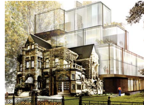
Planned redevelopment on Jarvis Street (Hariri Pontarini Architects)